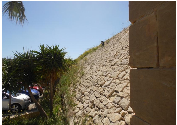
Well-Conserved Embankment leading to Covered Ways