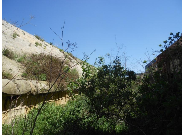
Part of Ditch and Escarpment